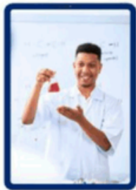
Top Educators Opening Their Classes Live via Zoom